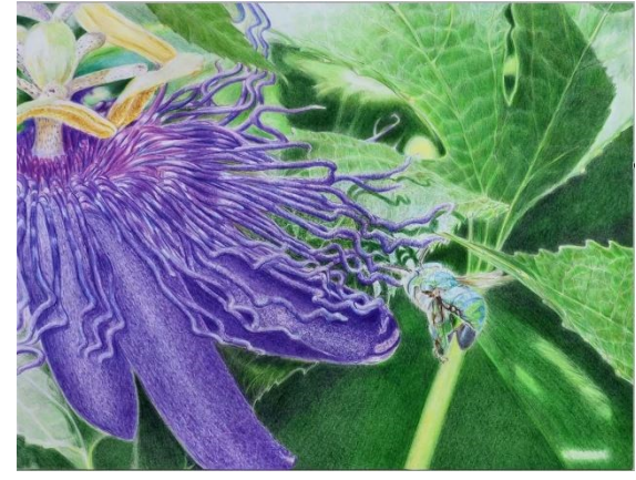
Bob - Green Orchid Bee