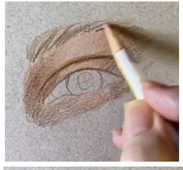
Peach wash all over