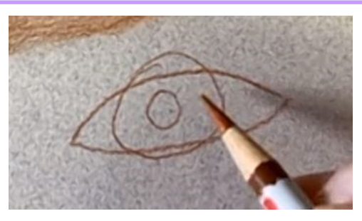
Pupil is in the center of the iris