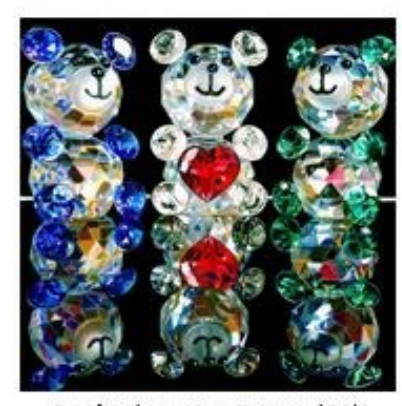
Bearflections, Alma Cartaya (CA) $2,000 Best of Show, Explore This! 16